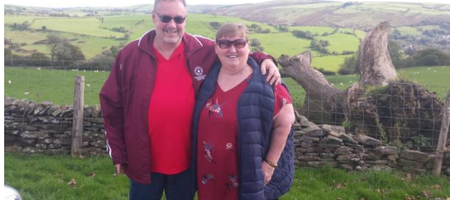
Both now back safe and sound

If you have a new phone number, please notify the office. We are preparing the 2018 membership